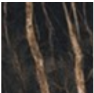
Noir desir glossy ceramic marble