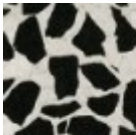
Venetian glossy ceramic